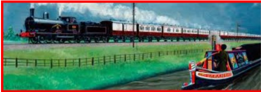
Steam train V's canal boat