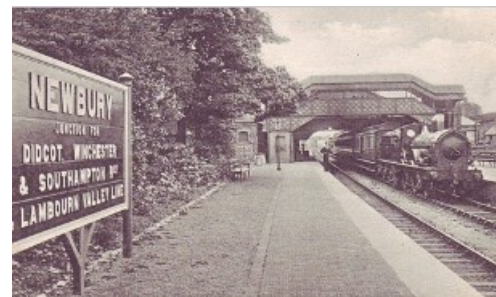
Newbury Train Station—opened 1847