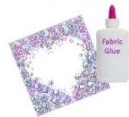
Adding sequins and shiny fabrics