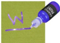
Textile paints - glitter