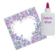
Adding sequins and shiny fabrics