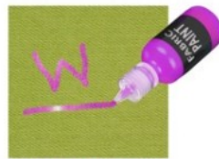
Textile paints - raised