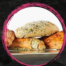
FRESHLY BAKED BREAD