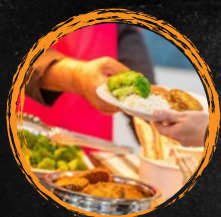
NUTRITIOUS MAIN MEALS