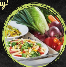
NEW TASTES AND TEXTURES WITH A TRIP TO THE SALAD BAR