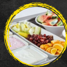
A DELICIOUS DESSERT